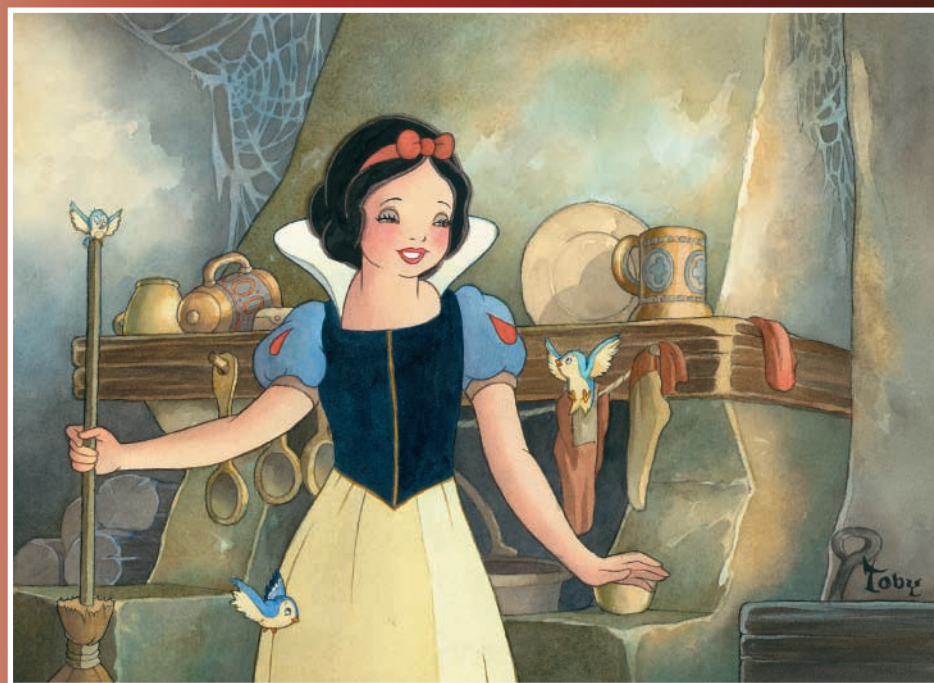
Dimensions: 10" x 14" Edition of 70