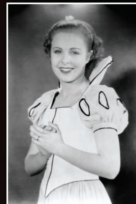
Black and white photograph of original live-action reference model for Snow White—Marge Champion Dimensions: 5" x 7"

"Coming Home" is a giclee print on hand-deckled archival watercolor paper featuring the seven loveable dwarfs as they march home to discover someone in their woodland cottage. Each piece in this edition has been hand-signed by Toby.