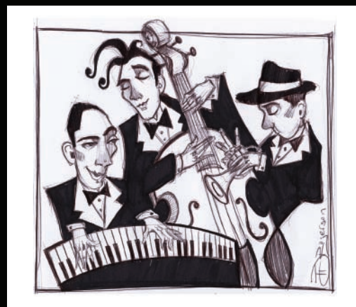
"Black and White Trio"